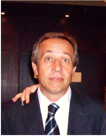
E. Stéfano (Argentina)